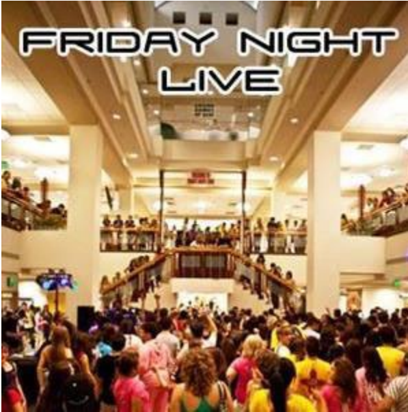
Friday Night Live!

Aug 16, 2024 - 7:00 PM Student Union Building